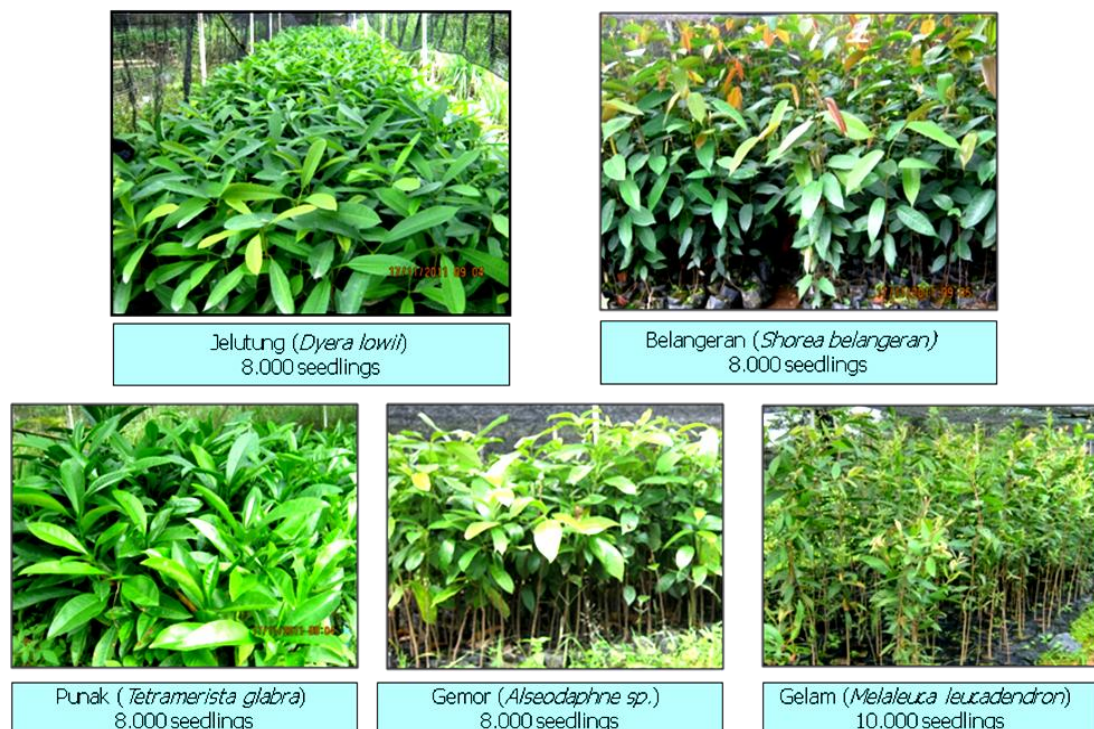
Figure 2. Five indigenous tree species which used for PSF restoration-rehabilitation activities in South Sumatra