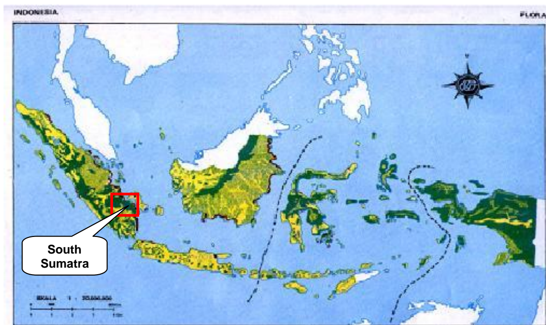
Figure 1. Location for project operational activities